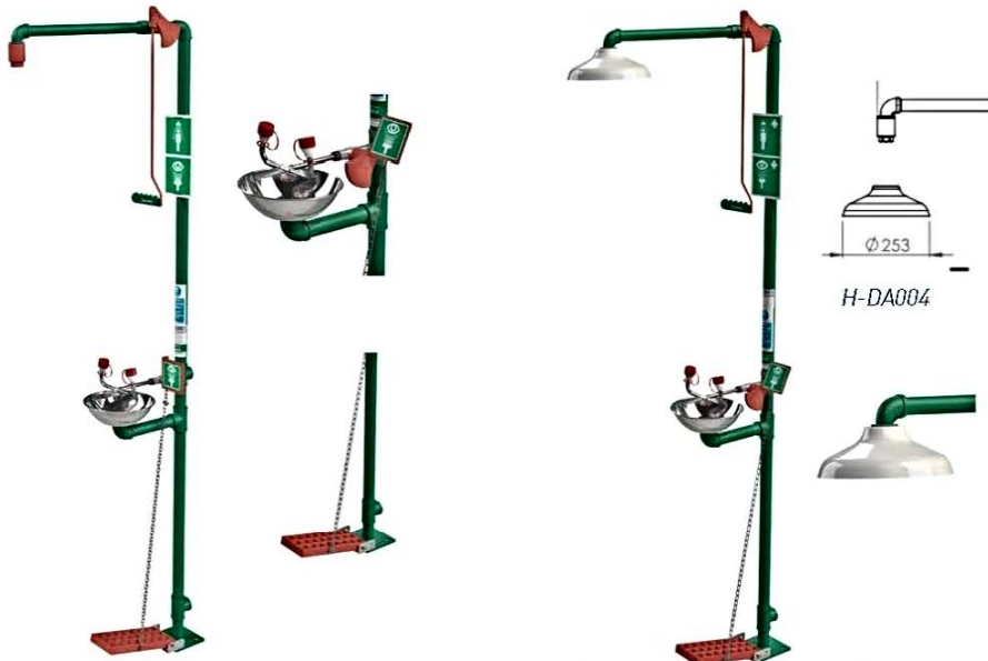
Shown with optional eye/face wash bowl (Part No. H-DA002)Foot treadle (Part no. H-DA003)