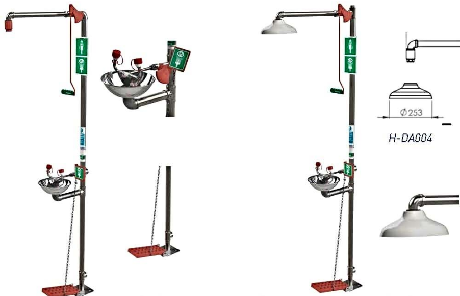
Shown with optional eye/face wash bowl (Part No. H-DA001) Foot treadle (Part no. H-DA003)